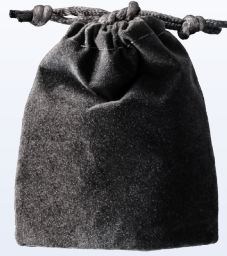
IS110523BK 2.75x3.5" AT Black Fabric Pouch

Anti Tarnish Draw String soft velveteen pouches are perfect for protecting a variety of silver & gold items from the damaging effects of tarnish and oxidation. They are safe for all metals and gemstones, and protect items from tarnish for up to 3 years.