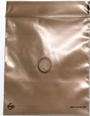
CI202410H 20x23" Anti Tarnish Zip Bag