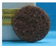
IS1106F Filtration Replacements (3 Pack)

The Intercept Complete Cabinet Filtration Unit provides perfectly safe, non-toxic protection for all metals and gemstones in jewelry showcases and storage areas. Simply place the unit in a showcase—hide it behind a tray or display pad. The ICF Filter unit comes with 1 Corrosion Intercept® filter pad for neutralizing atmospheric pollutants. Filter pads and batteries should be changed approximately every 90 days. Additional filter pads can be purchased on our products page. Runs on 2 "D" Batteries (not included).