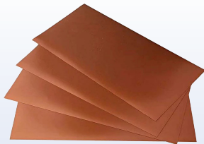
CIT180714 12mil 7x14" Anti Tarnish Poly Tray Cover

Anti Tarnish Poly Tray Covers prevent tarnish of your jewelry for up to 12 months. The cover works by absorbing and neutralizing tarnish-causing gases without leaving any deposits on items it protects. The cover has a built in saturation indicator - when the cover begins to change to a gray or black color, it's time to replace it with a new one. Trim the cover as needed to fit half-size trays. Corrosion Intercept is non-toxic, non-abrasive, recyclable and environmentally friendly.