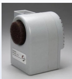
IS1106 Tarnish Prevention Complete Filtration Unit