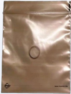
CI101215 10x12" Anti Tarnish Zip Bag