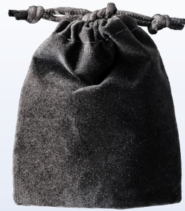
IS110545BK 4x5.5" AT Black Fabric Pouch