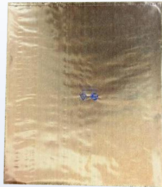
CI14160T Clear 14x16" Anti Tarnish Bag (No Zip)