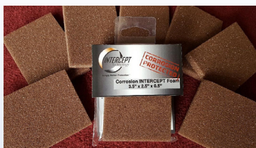
IS110623P 2.55x3.55" Anti Tarnish Foam Pad Inserts

Intercept Foam™ eliminates the need for oils, chemicals, and other coatings to protect your precious metal items from tarnish and corrosion. Intercept Foam™ is the next evolutionary step for applications such as cabinets, drawers, showcases, compartments, larger boxes, etc. Intercept Foam™ has a massive sponge-like surface area, which absorbs and neutralizes harmful gases in enclosed spaces. A color change from copper/dark brown to light gray acts as an indicator that the pad needs to be replaced. Each foam pad typically protects 30 cubic feet of enclosed space for up to 1 year. For larger spaces simply add additional pads.